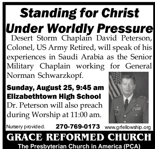
An advertisement used in 2002