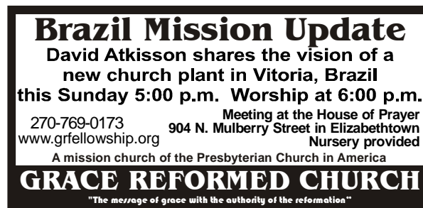
An advertisement used in 2001